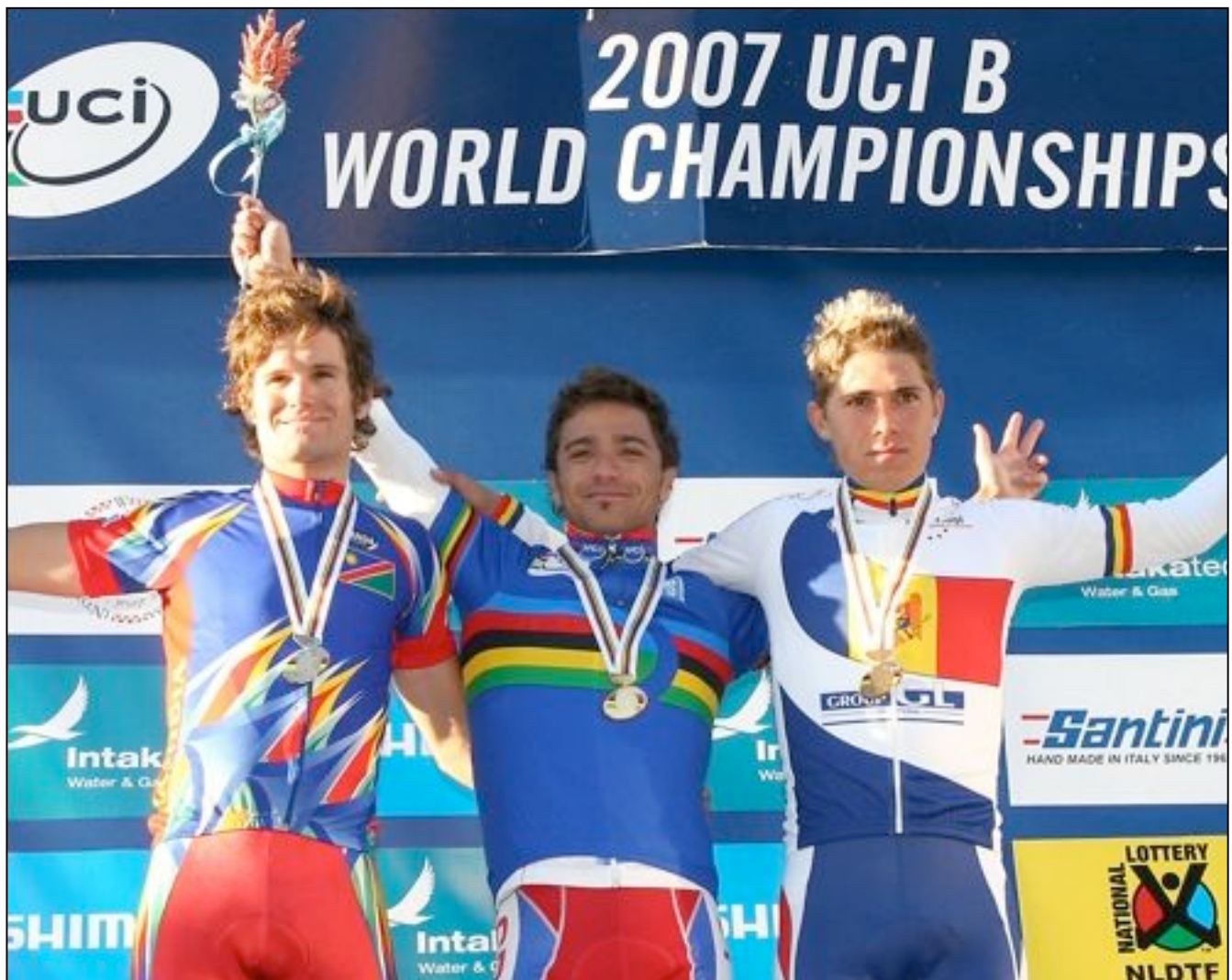
Pro Alliance Photographic